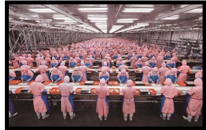
Deda Chicken Processing Plant, Dehui City, Jilin Province, 2005