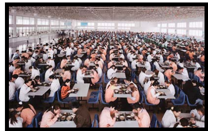
Youngor Textiles, Ningbo, Zhejiang Province, 2005