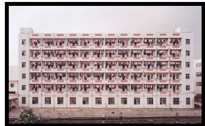
Factory Worker Dormitory, Dongguan, Guangdong Province, 2005